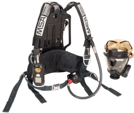
FireHawk M7XT Air Mask